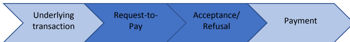
Figure 1: RTP process components and context

In a simplified view, the RTP-related process components can be illustrated as follows: